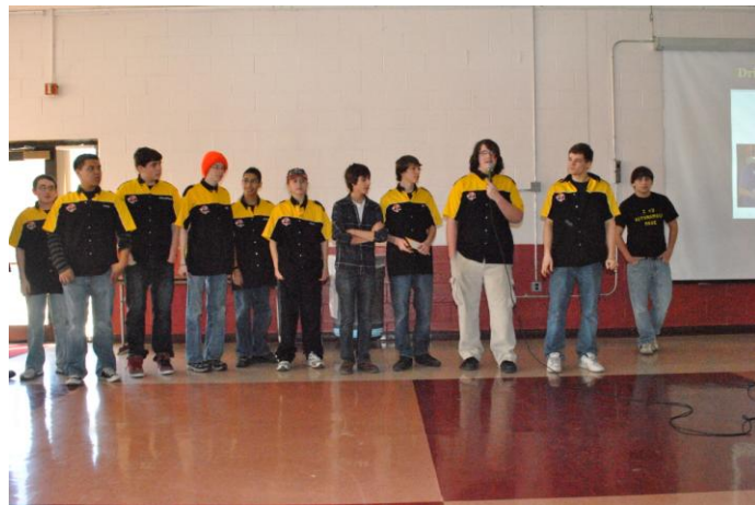
The Drive Train team explaining their sub-team.

So many people turned up for the unveiling of our robot!