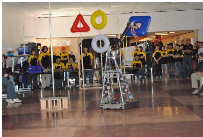
The robot placing a tube on the top rack...with success!